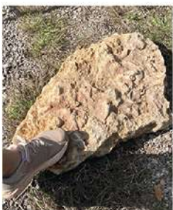
Nice Big Horn Coral Plate