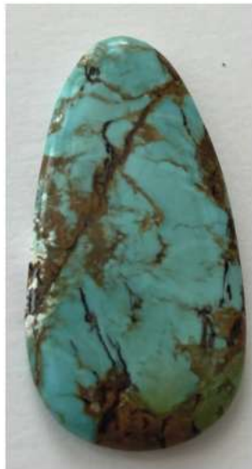
approx 20x40 mm

Don't worry about being an artist - drawing skill doesn't matter! Just sketch the best you can whatever ideas you have to share will be welcomed!