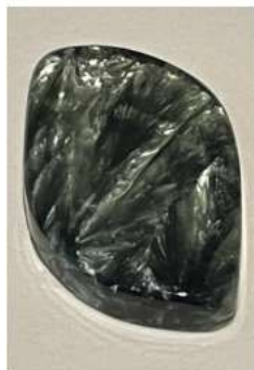
approximately 12 x 20 mm

This stone is approx 12x20 mm the challenge is to add it to one or more other stones and make a piece of jewelry. ID also in your design.