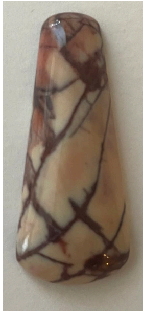
This stone graduates from 8mm - 15mm width x 34mm long

Don't worry about being an artist - drawing skill doesn't matter! Just sketch the best you can whatever ideas you have to share will be welcomed!