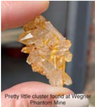
Pretty little cluster found at Wegner Phantom Mine