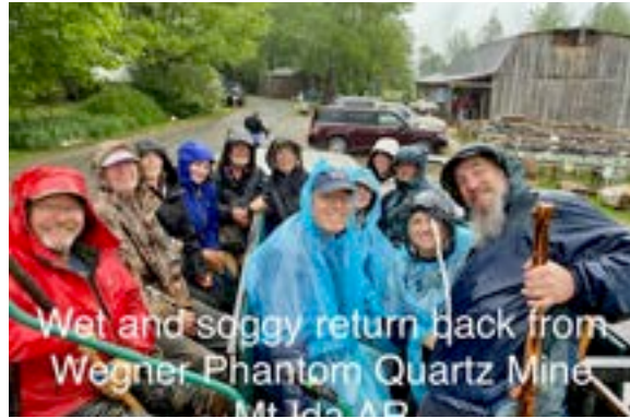
Wet and soggy return back from Wegner Phantom Quartz Mine Mt Ida AR