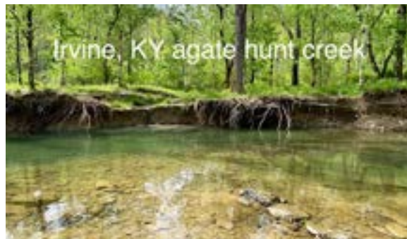
Irvine, KY agate hunt creek