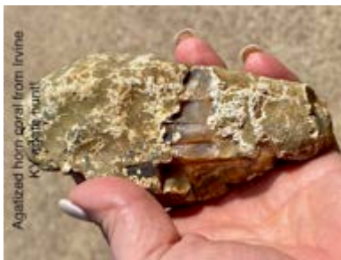
Agatized horn coral from Irvine KY agate hunt