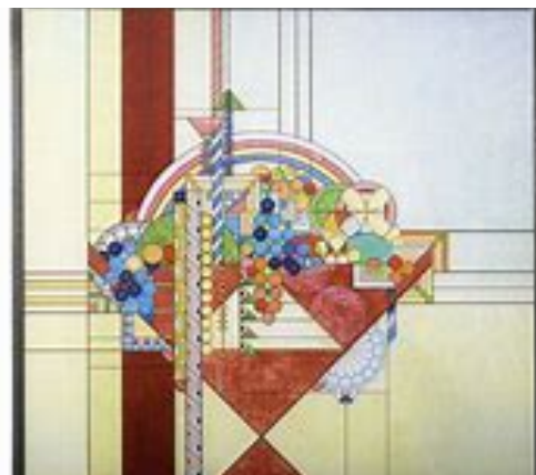
Frank Lloyd Wright May Basket