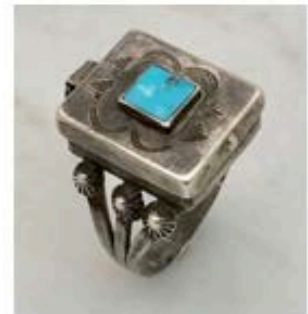
Pillbox/"poisoner's" ring. Artist-unknown

→ Since no contest is complete without prizes: First place, in each division, will receive a $75 gift certificate for Otto-Frei Jewelry Supply. Second place—beginning and intermediate only—will receive a $50 gift certificate for Otto-Frei Jewelry Supply. And, everyone will earn all the bragging rights they want.