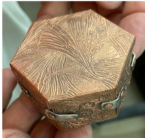
Etched and Riveted Containers Made by Students in Intermediate Metalsmithing Class